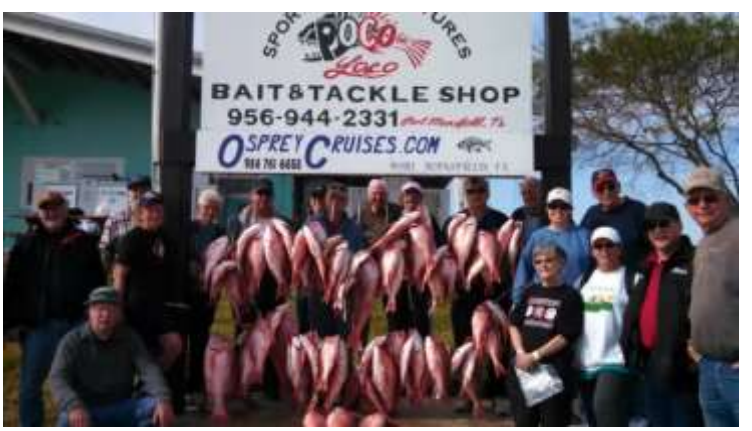
First deep sea fishing trip on January 18<sup>th</sup> was a big success with all catching their limit of mostly red snapper. Next trip is scheduled for February 15<sup>th</sup>.